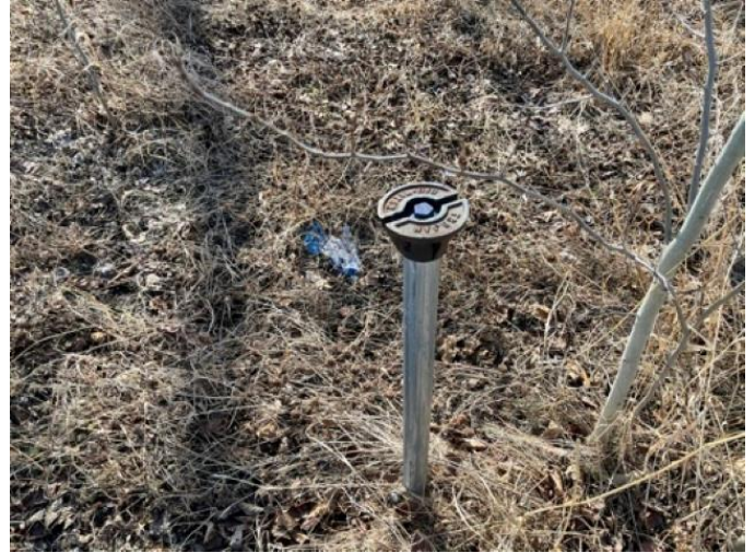
Water valve located east of driveway