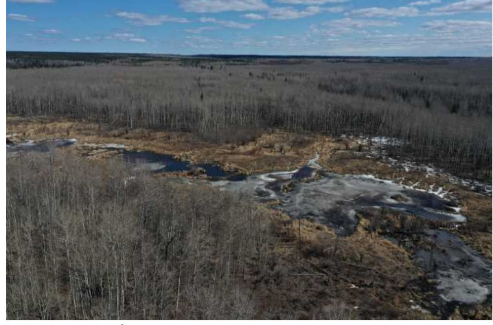
Creek south of property

Your own private getaway on 80.06 treed acres at the end of No Exit Township Rd 804. Property is bordered by crown land on both south and east boundaries. The creek in the crown land to south, runs past the southeast corner of this property as it winds into the crown land to the east. Access is limited - due to condition of trail on undeveloped Township Road 804 just before the property.