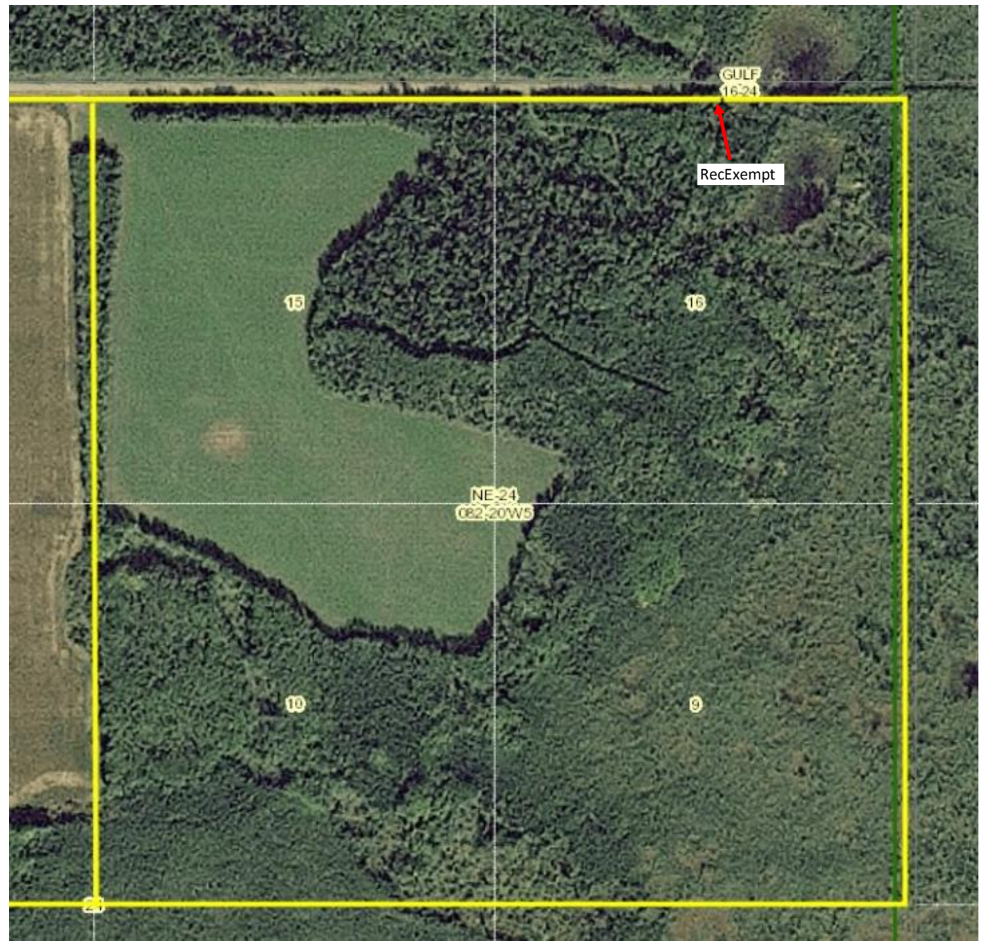
NE24-82-20-W5 No Pipelines. Rec Exempt Surface Lease in northeast corner